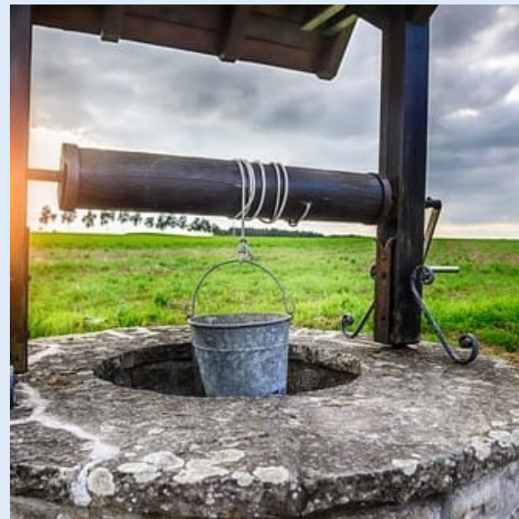
Access to water

MDSCarbon supports programs that protect and restore forests, helping to reduce emissions of carbon and preserve biodiversity.