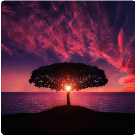
Emission Compensation of CO 2

Companies and individuals calculate their CO 2 emission and buy MDSCO 2 carbon coins equivalent to your footprint carbon.