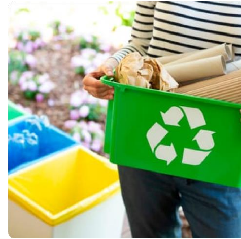
Investment in Projects of Sustainability

Carbon currency can be negotiated and exchanged between companies and individuals, creating a more carbon market efficient.