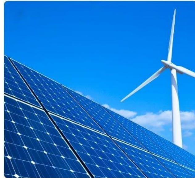
Alternative energy sources

Projects aimed at planting trees and reforesting areas impacted by human action, such as devastation of the Amazon.