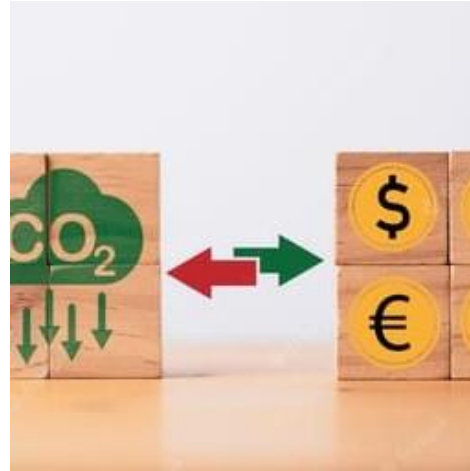
Exchange and Commerce

Companies and individuals calculate their CO 2 emission and buy MDSCO 2 carbon coins equivalent to your footprint carbon.