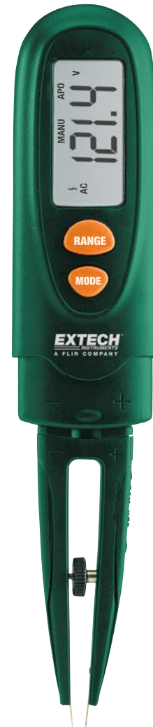
Take voltage measurements using the attachable test lead tip